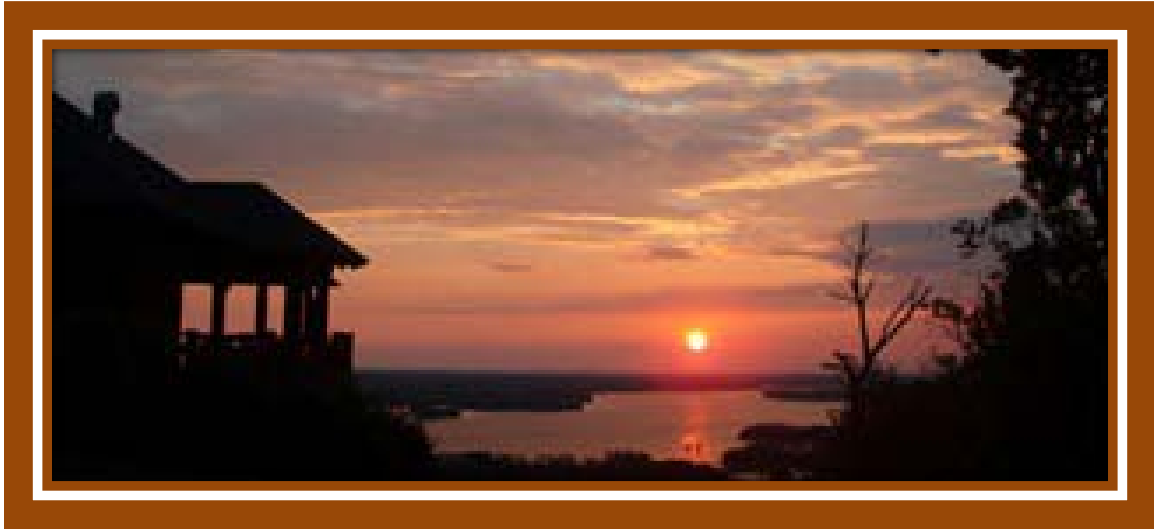
And there you have it — the Clubhouse of The Springs at High Rock

The Springs at High Rock Featured Property of the Month — August 2013 – Clubhouse