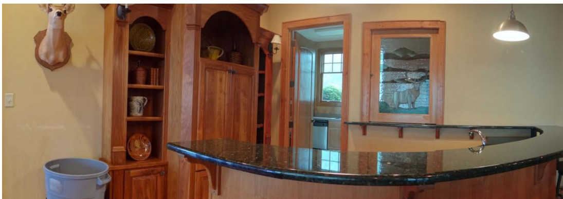
The bar in the Game Room