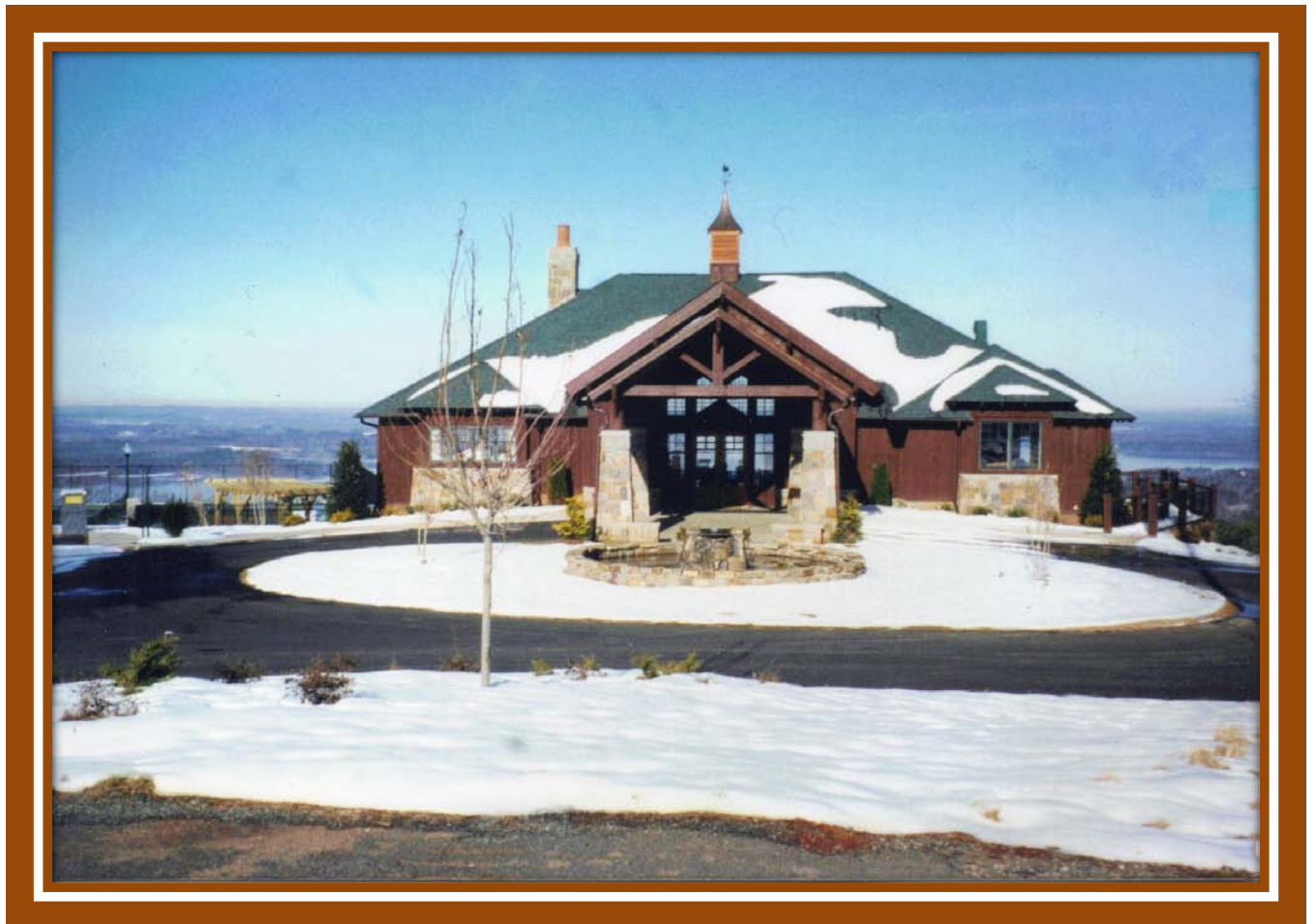
The Springs at High Rock Featured Property of the Month — August 2013 – Clubhouse